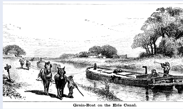
Grain-Boat on the Erie Canal.